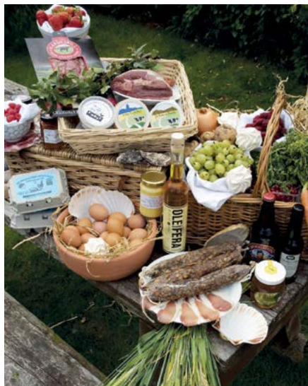
Showcasing local food and drink

Operational services will begin on the new Borders Railway in September 2015. Track will be laid, signalling tested, drivers trained and seven new stations will welcome their first users.