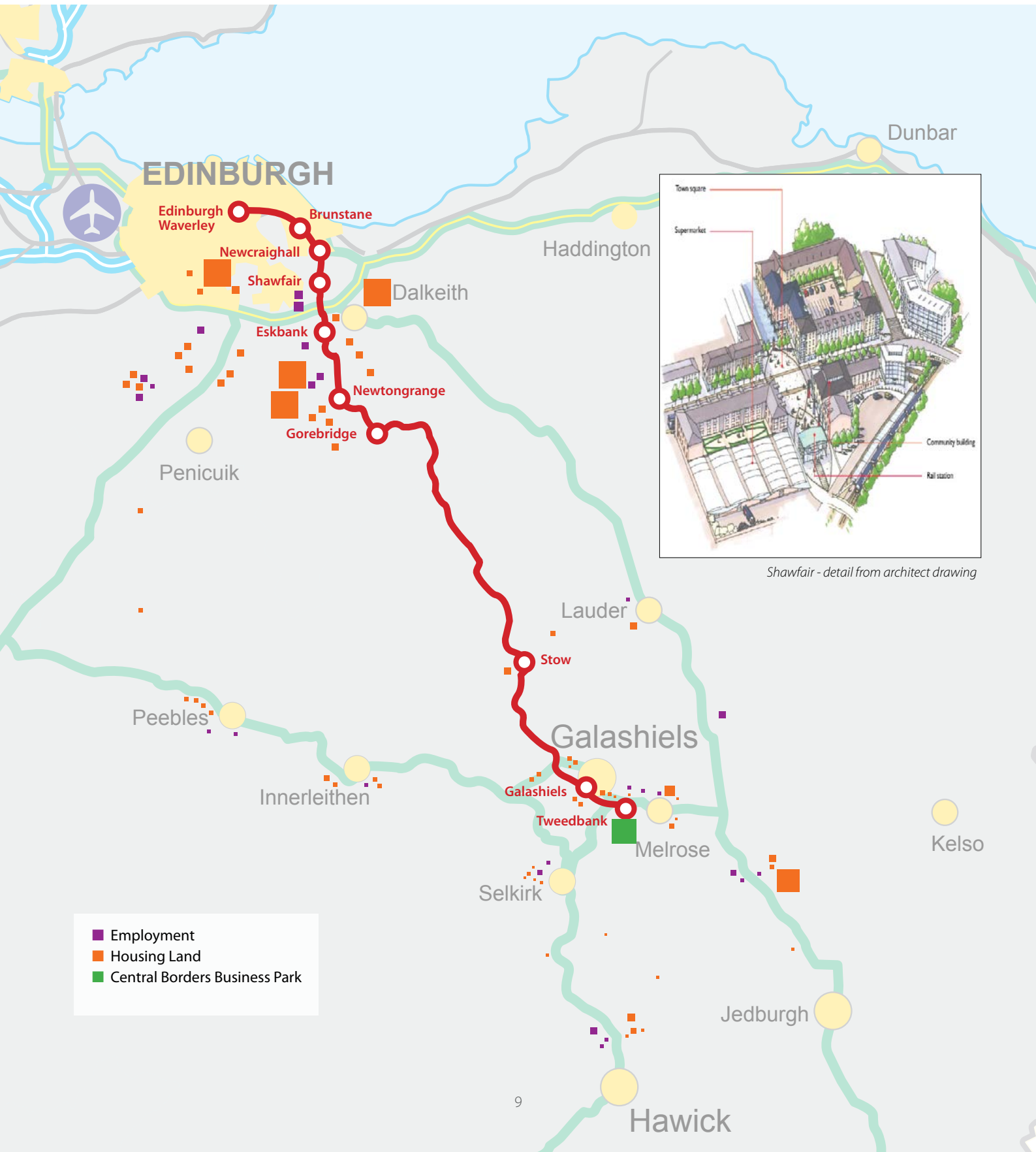
Shawfair - detail from architect drawing