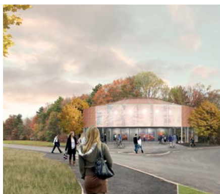
Great Tapestry of Scotland – architect drawing

For the official Opening Celebration weekend, we are planning an exciting programme of activities. The Borders Railway Exposition will showcase what is on offer in the Railway Corridor Area and Station Hubs under various themes including trade and investment, food and drink and textiles manufacture.