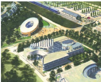
Central Borders Business Park – detail from artist drawing