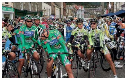
Tour of Britain, Peebles

This will coincide with the beginning of international events such as the 2015 Walking Festival and the Tour of Britain.